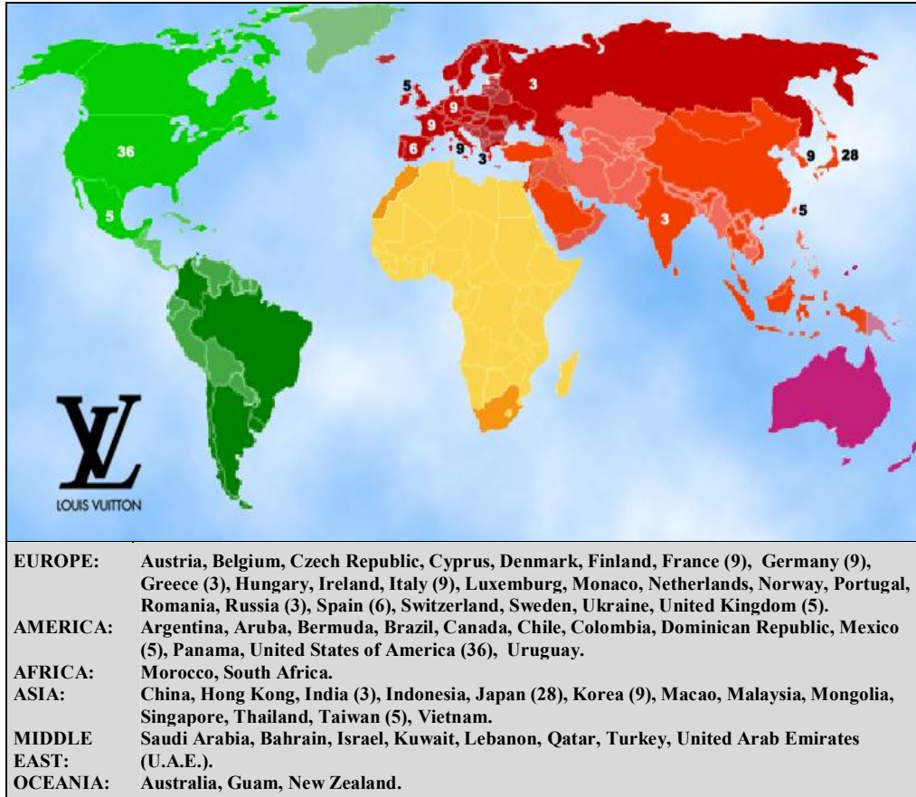
Table 4: Markets with Louis Vuitton brand presence (year 2009)